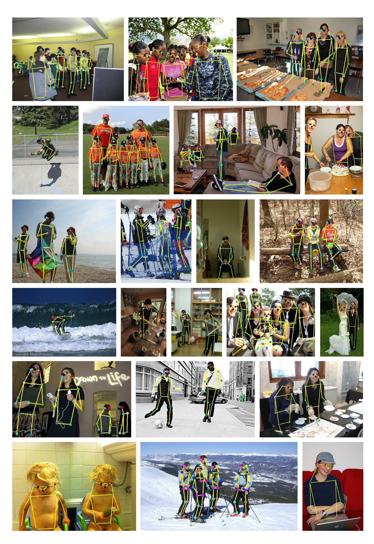
Figure 3. Some results of our method.