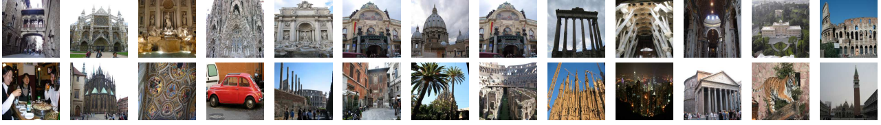
Figure 3. Examples of anchor images selected by the proposed method for the image retrieval application. Random samples from the top 100 (1000) anchors are shown in the top (bottom) row according to the node importance.