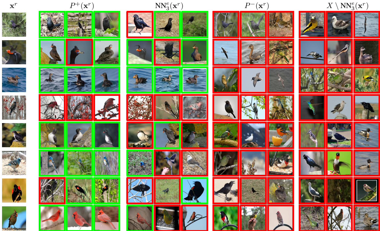
Figure 2. Sample CUB200-2011 anchor images ( \mathbf{x}^r ), positive images from our method ( P^+(\mathbf{x}^r) ) and baseline ( NN_3^e(\mathbf{x}^r) ), and negative images from our method ( P^-(\mathbf{x}^r) ) and baseline ( X \setminus NN_3^e(\mathbf{x}^r) ). The baseline is Euclidean nearest neighbors and non-neighbors [16]. Positive (negative) ground-truth framed in green (red). Labels are only used for qualitative evaluation and not during training.

and so on. In this case, given current parameters \theta , the set Z = \{f(\mathbf{x}; \theta) : \mathbf{x} \in X\} plays the role of Y for the following iteration. This alternating training scheme is common for methods involving a global dataset structure like a graph or a set of clusters [44, 4, 68]. Our idea is orthogonal to most concurrent improvements on metric learning.