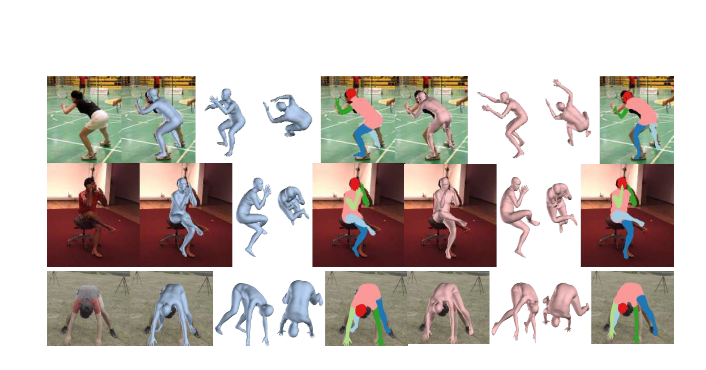
Figure 4: Results with and without paired 3D supervision. 3D reconstructions, without direct 3D supervision, are very close to those of the supervised model.

The results are surprisingly competitive given this chal-