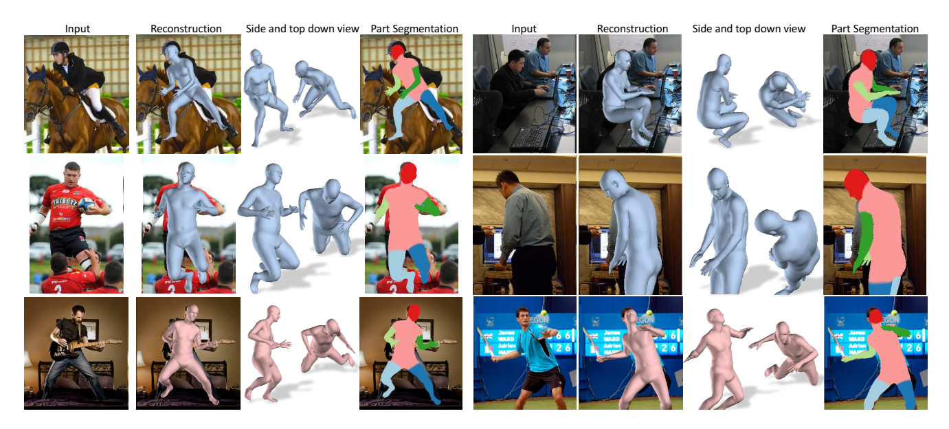
Figure 1: Human Mesh Recovery (HMR): End-to-end adversarial learning of human pose and shape. We describe a real time framework for recovering the 3D joint angles and shape of the body from a single RGB image. The first two rows show results from our model trained with some 2D-to-3D supervision, the bottom row shows results from a model that is trained in a fully weakly-supervised manner without using any paired 2D-to-3D supervision. We infer the full 3D body even in case of occlusions and truncations. Note that we capture head and limb orientations.