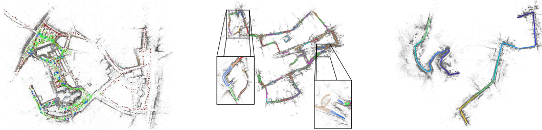
Figure 3. 3D models of the Aachen Day-Night (left, showing database (red), day-time query (green), and night-time query images (blue)), RobotCar Seasons (middle), and CMU Seasons (right) datasets. For RobotCar and CMU, the colors encode the individual submaps.

Ground truth poses for the queries. Due to GPS drift, the INS poses cannot be directly used as ground truth. Again, there are not enough feature matches between day- and night-time images for SfM. We thus used the LIDAR scanners mounted to the vehicle to build local 3D point clouds for each of the 49 submaps under each condition. These models were then aligned to the LIDAR point clouds of the reference trajectory using ICP [5]. Many alignments needed to be manually adjusted to account for changes in scene structure over time (often due to building construction and road layout changes). The final median RMS errors between aligned point clouds was under 0.10m in translation and 0.5^\circ in rotation across all locations. The alignments provided ground truth poses for the query images.