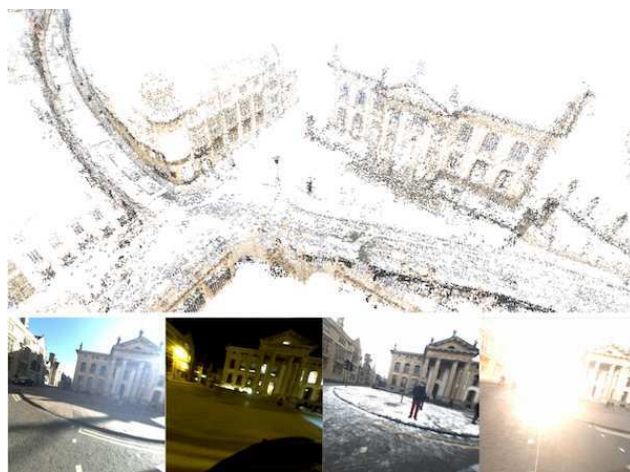
Figure 1. Visual localization in changing urban conditions. We present three new datasets, Aachen Day-Night , RobotCar Seasons (shown) and CMU Seasons for evaluating 6DOF localization against a prior 3D map (top) using registered query images taken from a wide variety of conditions (bottom), including day-night variation, weather, and seasonal changes over long periods of time.

[50, 65, 73], reducing memory requirements [12, 33, 50], and more flexible scene representations [54]. All these methods utilize local features to establish 2D-3D matches. These correspondences are in turn used to estimate the camera pose. This data association stage is critical as pose estimation fails without sufficiently many correct matches. There is a well-known trade-off between discriminative power and invariance for local descriptors. Thus, existing localization approaches will only find enough matches if both the query images and the images used to construct the 3D scene model are taken under similar viewing conditions.