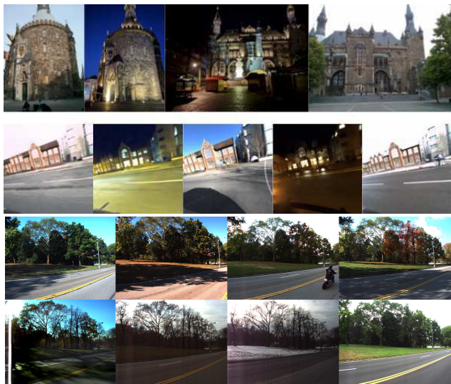
Figure 2. Example query images for Aachen Day-Night (top), RobotCar Seasons (middle) and CMU Seasons datasets (bottom).

from the reference and day-time query images. The scale of the reconstruction is recovered by aligning it with the geo-registered original Aachen model. As in [33], we obtain the reference model for the Aachen Day-Night dataset by removing the day-time query images. 3D points visible in only a single remaining camera were removed as well [33]. The resulting 3D model has 4,328 reference images and 1.65M 3D points triangulated from 10.55M features.