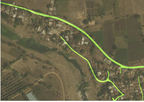
Figure 1. A satellite image with overlay binary masks where green pixels indicate class membership (roads).

which enables precise pixel-level localization. A large number of feature channels in upsampling part allows propagating context information to higher resolution layers. This type of network architecture proven themselves in binary image segmentation competitions for satellite image analyses [6, 7, 12, 13].