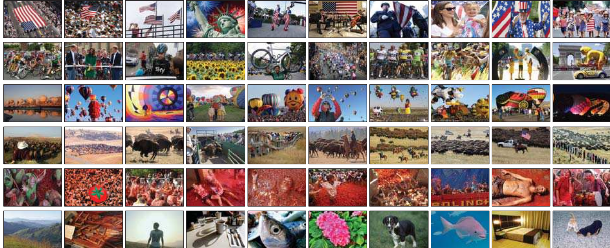
Figure 3. Selected samples from five cultural events ( July 4 th , Tour de France , Balloon Fiesta , Annual Buffalo Roundup , and La Tomatina ) and one non-class (the bottom row). More specifically, July 4 th is a federal holiday commemorating the adoption of the Declaration of Independence on July 4 th in the year of 1776; Tour de France is an annual multiple stage bicycle race primarily held in France, while also occasionally making passes through nearby countries; Balloon Fiesta is a yearly festival of hot air balloons that takes place in Albuquerque, New Mexico, USA during early October; Annual Buffalo Roundup is held in Custer State Park, South Dakota, USA in September, and the bison there are rounded up, with several hundred sold at auction so that the remaining number of animals will be compatible with the rangeland forage; and La Tomatina is a festival held in Spain, in which participants throw tomatoes and get involved in this tomato fight purely for entertainment purposes.

t constitute possible cues for characterizing certain events, while preserving the inherent inter / intra class variations. Figure 3 shows some example images for several cultural events, such as July 4 th , Tour de France , Balloon Fiesta , Annual Buffalo Roundup , and La Tomatina .