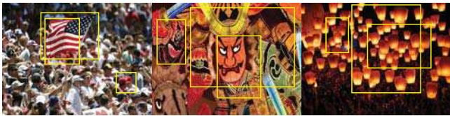
Figure 2. Examples of spatial regions with larger prediction scores (deep networks outputs) in images.