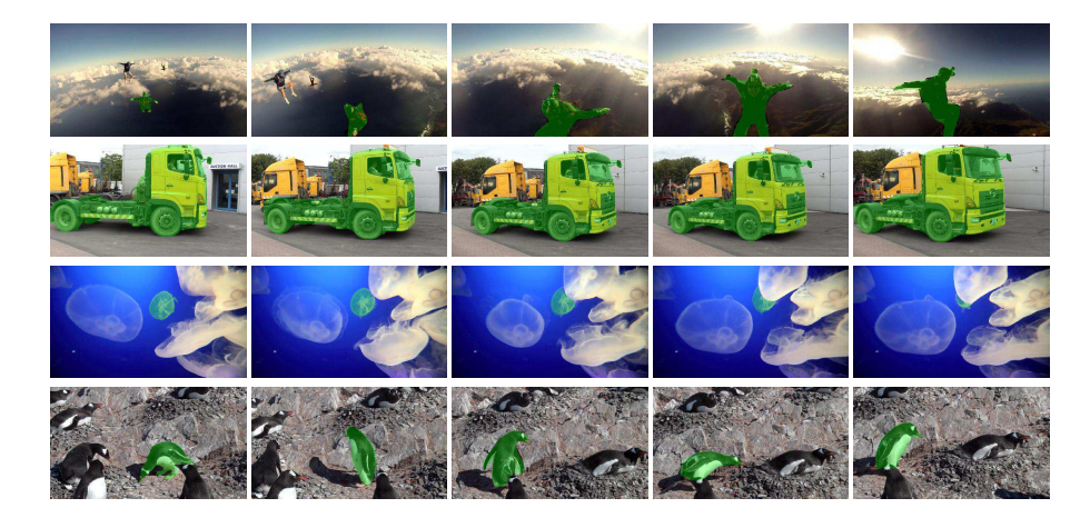
Fig. 4: Some visual results produced by our model without online learning on the YouTube-VOS test set. The first column shows the initial ground truth object segmentation (green color) while the second to the last column are predictions.

two rows are from unseen categories. In addition, each example represents some challenging cases in video object segmentation. For example, the person in the first example has large changes in appearance and illumination. The second and third examples both have multiple similar objects and heavy occlusions. The last example has strong camera motion and the penguin changes its pose frequently. Our model obtains accurate results on all the examples, which demonstrates the effectiveness of spatial-temporal features learned from large-scale training data.