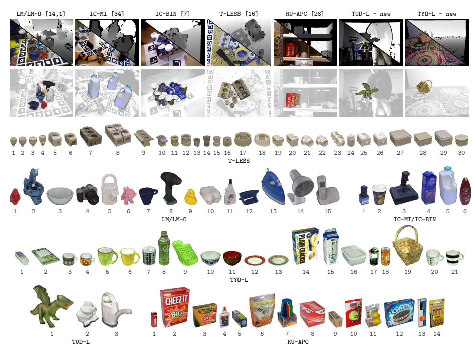
Fig. 1. A collection of benchmark datasets. Top: Example test RGB-D images where the second row shows the images overlaid with 3D object models in the ground-truth 6D poses. Bottom: Texture-mapped 3D object models. At training time, a method is given an object model or a set of training images with ground-truth object poses. At test time, the method is provided with one test image and an identifier of the target object. The task is to estimate the 6D pose of an instance of this object.

This work makes the following contributions: