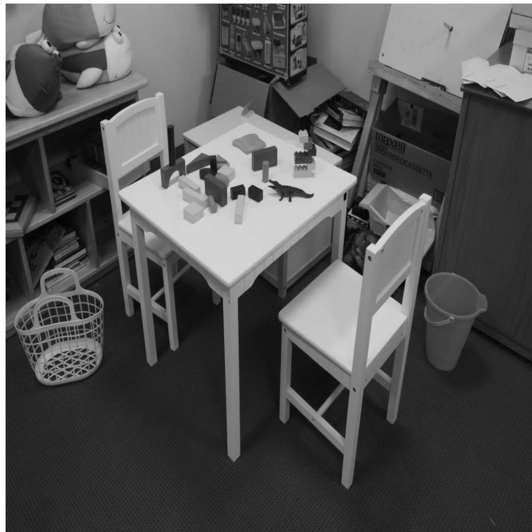
Input monochrome image: I_{v_2, S_H, l_H}^Y