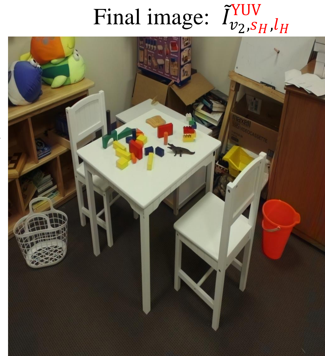
Final image: \tilde{I}_{v_2, S_H, l_H}^{YUV}