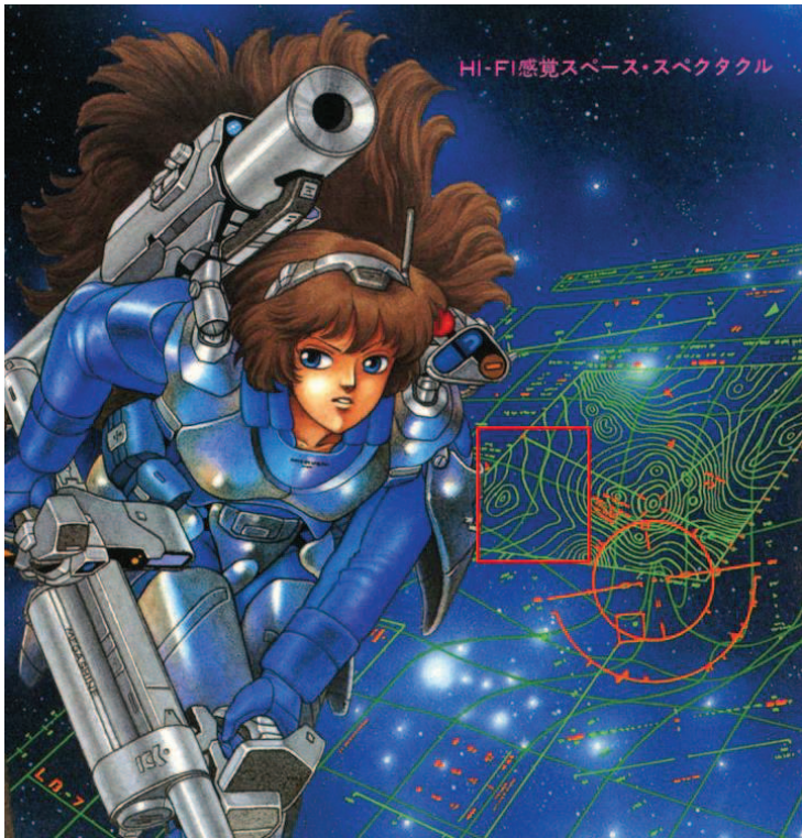
Manga109 ARMS x4