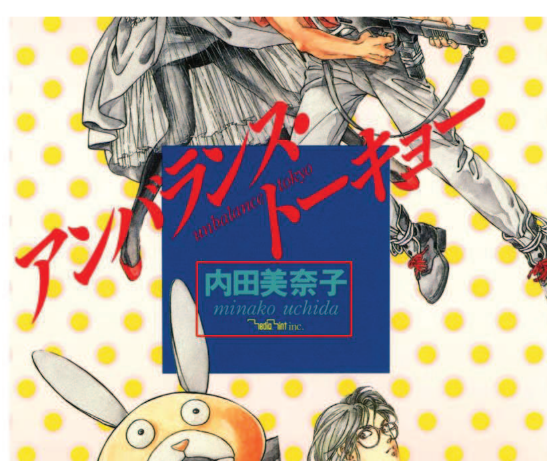
Manga109 UnbalanceTokyo x4