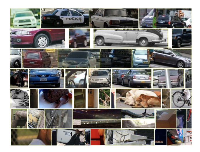
Figure 4: Visualization of the exemplars in an identified unknown class by the first clustering in EOPSN.

Figure 5 presents the comparison of the open-set panoptic segmentation methods. between the baseline model (the third row) and EOPSN (the forth row) on the COCO val set with K=20%. The unknown classes in the figures are "stop sign", "car", "keyboard", "sink", and "toilet". The second row shows ground-truths, where unknown classes are in orange. We observe that EOPSN successively finds