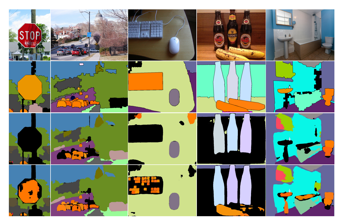
Figure 5: Qualitative results on the COCO val set with K=20%. The first row presents input images and the subsequent rows illustrate ground-truths, results of the baseline (Void-train), and those of EOPSN. Instances in the unknown class are denoted by orange color.

niques based on the class-agnostic objectness scores, i.e. , the baseline methods based on RPN, would have less merits since they only employ the ground-truth information of known classes.