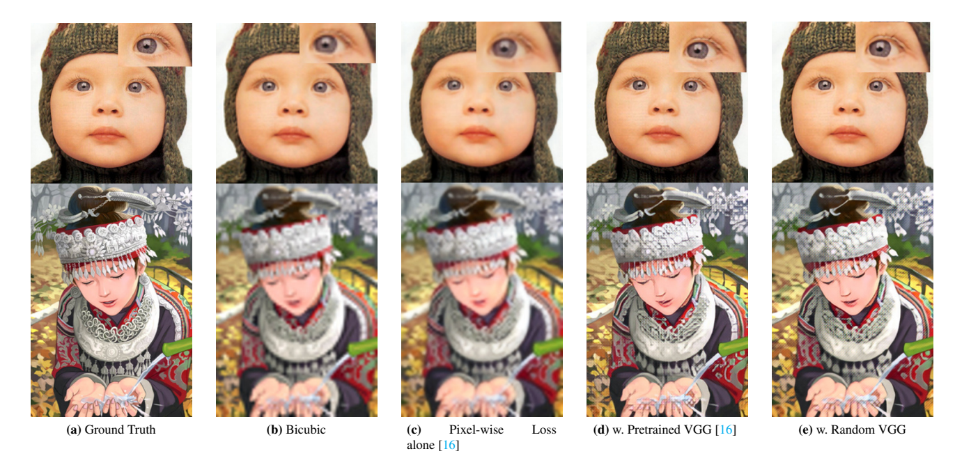
Figure 1 – Super-resolution results of the pilot experiments (super-resoled from 4× down-scaled images). (a) Ground truth high-resolution images. (b) Bi-cubic up-sampling. (c) SRResNet [16] trained with the per-pixel loss. (d) SRResNet trained with the per-pixel loss and perceptual loss with a pretrained VGGNet. (e) SRResNet trained with the per-pixel loss and perceptual loss with a randomly-weighted VGGNet. We can see that the perceptual loss improves image quality. Besides, formulating the perceptual loss with a pre-trained network and a randomly-weighted network produces on par results.

depth estimation and instance segmentation [18]. For example, the pairwise term in Markov Random Filed is complementary to the unary term, which defines pairwise compatibility and in general improves prediction accuracy especially when the unary term alone is not sufficient. The proposed generic perceptual loss can be easily applied to these dense prediction tasks, with no computation overhead during inference. Also, as now pre-training with labelled data is not required, it is straightforward to explore the effectiveness of using various network structures—not necessary the VGG—to model the dependency between output variables.