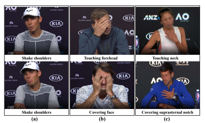
Figure 4. Examples of challenging recognition of the microgestures.

From Table 2, we can summarize several observations: