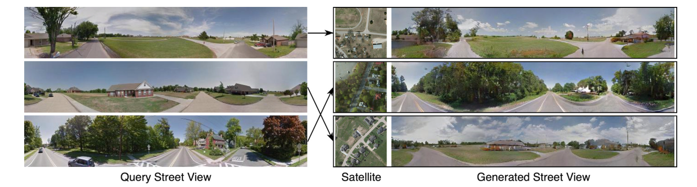
Figure 1: For a collection of satellite and street images, our method synthesizes the street view for each satellite input (right). It also simultaneously determines the geographic location of a query street image by matching it with the closest satellite image in the database (left right). This is done in one single architecture which allows for end-to-end training.

{aysim.toker, gunjie.zhou, maxim.maximov, leal.taixe}@tum.de