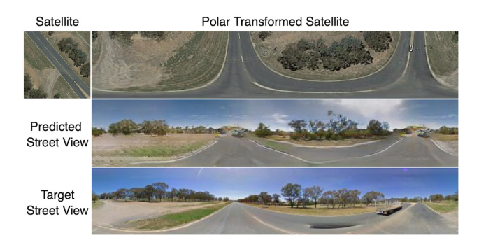
Figure 4: Qualitative result on CVACT. We show the input satellite-to-street pair, as well as the polar transformed satellite image and our synthesized street view. Note, that the considered baselines [22] cannot be applied here since there are no ground-truth annotated semantic maps on CVACT.

Discussion Table 2 contains a summary of our image synthesis results in terms of the quality metrics mentioned above. We compare our generated images to the current state-of-the-art in cross-view image synthesis. The first baseline method [39] predicts auxiliary semantic segmentation labels on the satellite images, maps them to the street view, and uses them to generate a corresponding ground-level image. [22] introduced two different architectures: X-Fork and X-Seq. Moreover, [22] shows comparisons to the generic image-to-image translation architecture Pix2pix [12] on cross-view synthesis. Along the same lines,