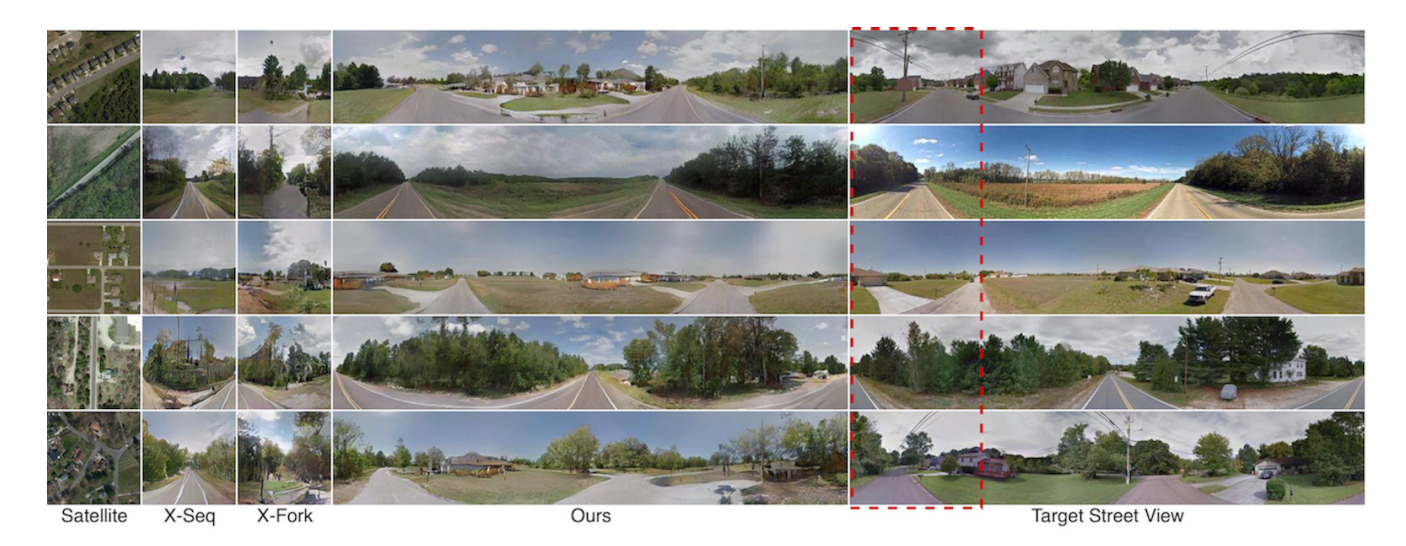
Figure 3: Qualitative comparisons for cross-view image synthesis on the CVUSA benchmark. We compare the images generated by our method with the best baselines X-Fork and X-Seq [22]. Note, that they focus on synthesizing the first quarter of the street view (which is equivalent to the red, dashed boxes on the target street-view), our method is able to create coherent full street view panoramas.