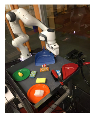
(a) Train: Random Interaction