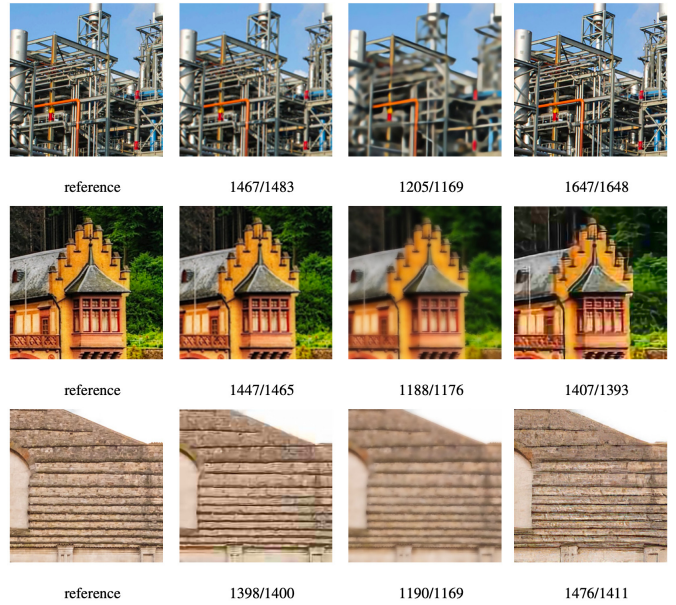
Figure 3: PIPAL examples and corresponding quality scores predicted by the IQMA network. Column 1 is reference images and columns 2-4 are distorted images. For each distorted image, underline captions denote (ground truth score)/(predicted score).