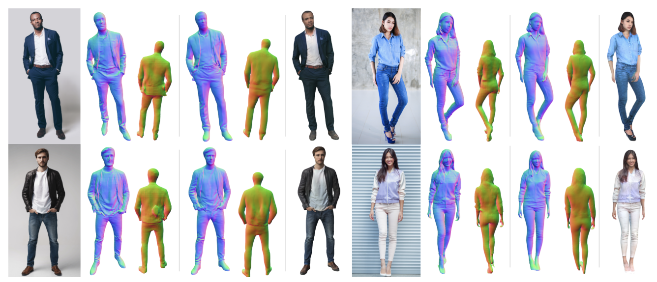
Figure 5. Qualitative comparisons on real images with the state-of-the-art method PIFuHD. We show front and back geometry produced by PIFuHD (left) and our results (right). Our reconstructions feature a similar level of detail but contain less noise and body poses are reconstructed more reliably. Additionally, our method is able to produce albedo and shaded surface color – we show our shaded reconstructions for reference.