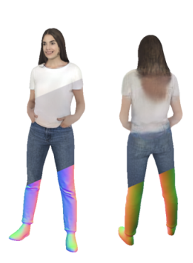
Figure 1. Given a single image, we reconstruct the full 3D geometry – including self-occluded (or unseen) regions – of the photographed person, together with albedo and shaded surface color. Our end-to-end trainable pipeline requires no image matting and reconstructs all outputs in a single step.

35, 36, 41]. While these methods sometimes produce astonishingly good results, they have several shortcomings. First, the techniques often produce appearance estimates where shading effects are baked-in, and some methods do not produce color information at all. This limits the usefulness of the resulting scans as they cannot be realistically placed into a virtual scene. Moreover, many methods rely on multi-step pipelines that first compute some intermediate representation, or perceptually refine the geometry using estimated normal maps. While the former is at the same time impractical (since compute and memory requirements grow), and potentially sub-optimal (as often the entire system cannot be trained end-to-end to remove bias), the latter may not be useful for certain applications where the true geometry is needed, as in the case of body measurements for virtual try-on or fitness assessment, among others. In most existing methods color is exclusively estimated as a secondary step. However, from a methodological point of view, we argue that geometry and surface color should be computed simultaneously, since shading is a strong cue for surface geometry [17] and cannot be disentangled.