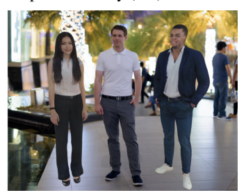
Figure 7. We can apply the estimated illumination from one image to another, which allows us to create the group picture (right) by inserting the reconstructions of the subjects (left) with matching shaded surface.

tion, see fig. 8. Loose, oversized, and non-Western clothing items are not well covered by our training set. The backside of the person sometimes does not semantically match the front side. A larger, more geographic and culturally diverse dataset would alleviate these problems, as our method does not make any assumptions about clothing style or pose.