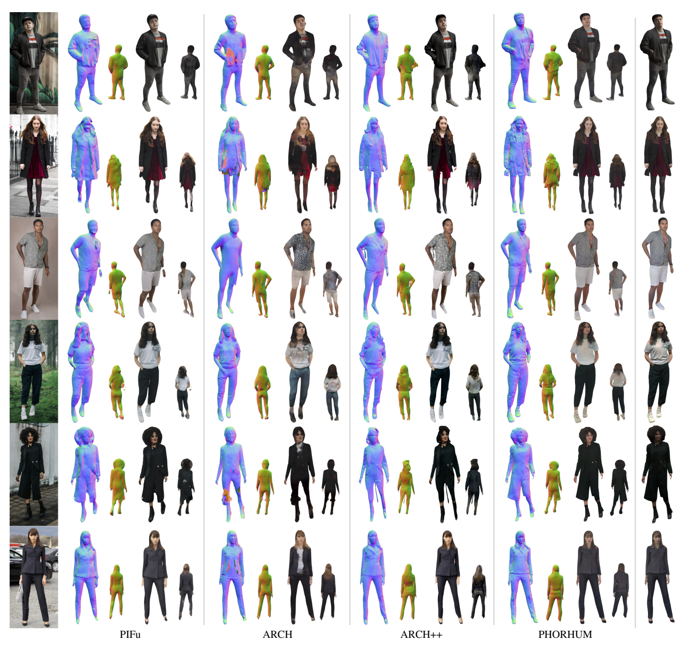
Figure 4. Qualitative comparisons on real images with state-of-the-art methods that produce color. From left to right: Input image, PIFu, ARCH, ARCH++, PHORHUM (ours), our shaded reconstruction. For each method we show the 3D geometry and the reconstructed color. Our method produces by far the highest level of detail and the most realistic color estimate for the unseen back side.

feature map, the feature extractor network does not learn to understand structural scene semantics. Here our patch-based rendering losses help, as they provide gradients for neighboring pixels. Moreover, our rendering losses could better connect the zero-level-set of the signed distance function with the color field, as they supervise the color at the current zero-level-set and not at the expected surface location. We plan to structurally investigate these observations, and leave these for future work.