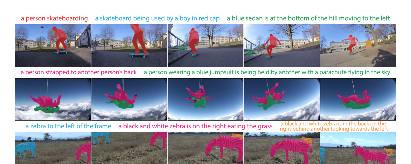
Figure 3. Visual examples of MTTR's performance on the Refer-YouTube-VOS [39] validation set. Best viewed in color. IoU