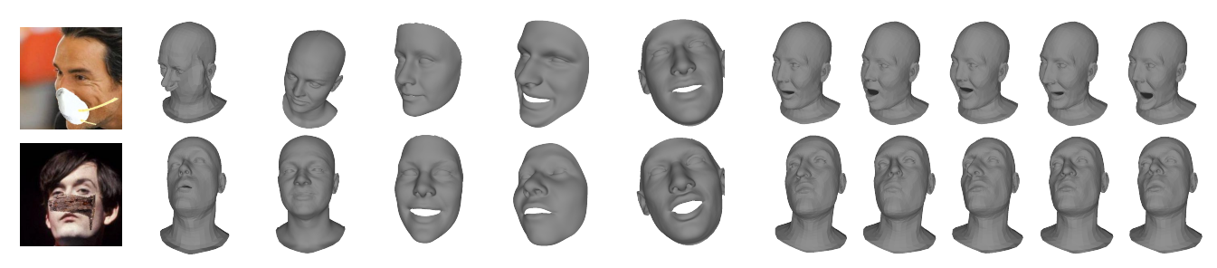
Target Image FLAME [21] DECA [11] CFR-GAN [17]Occ3DMM [8] Extreme3D [42] Reconstructions by Diverse3DFace (Ours) Figure 1. Diverse 3D reconstructions from a single occluded face image by Diverse3DFace vs. a singular solution by the baselines.