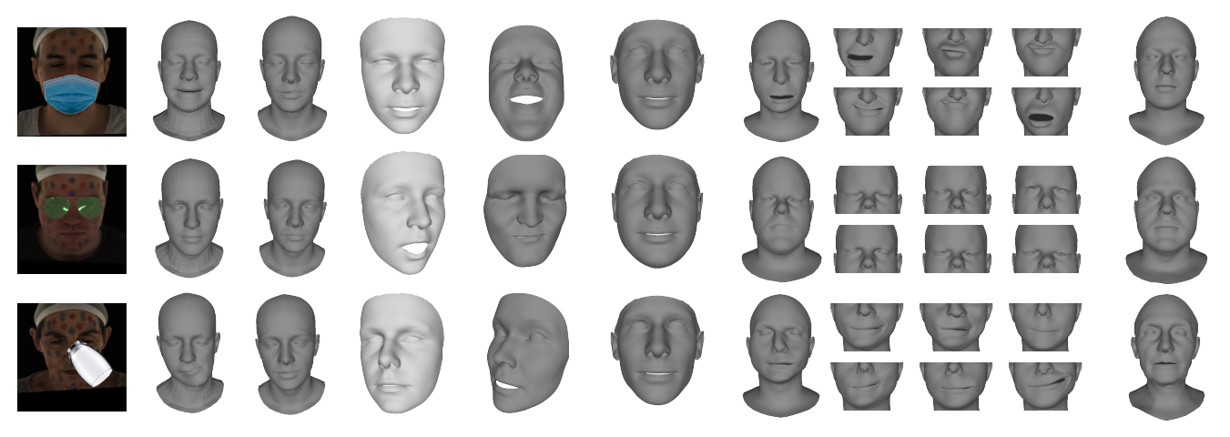
Target Image FLAME [21] DECA [11] CFR-GAN [17] Occ3DMM [8] Extreme3D [42] Reconstructions by Diverse3DFace (Ours) Ground truth