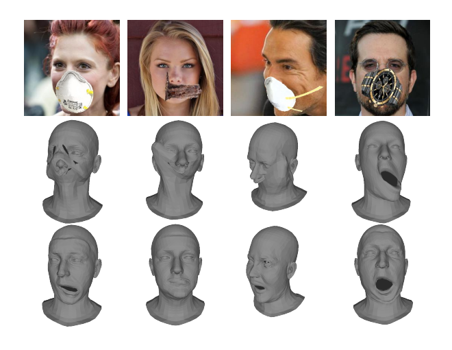
Figure 5. FLAME [21] based fitting (middle row) vs. our Global+Local fitting (last row) on occluded face images (top row).

FLAME vs Global+Local PCA Model: In addition to the quantitative comparison done in Tab. 1, we qualitatively compare the occlusion robustness of the global FLAME [21] model vs. our global+local model. In Fig. 5, we show some failure cases of the FLAME [21] based fitting on severely occluded images. Notice the severe deformations on the FLAME [21] fitted outputs, especially around the mouth. In contrast, the fittings by our global+local models look more faithful and detailed with respect to the visi-