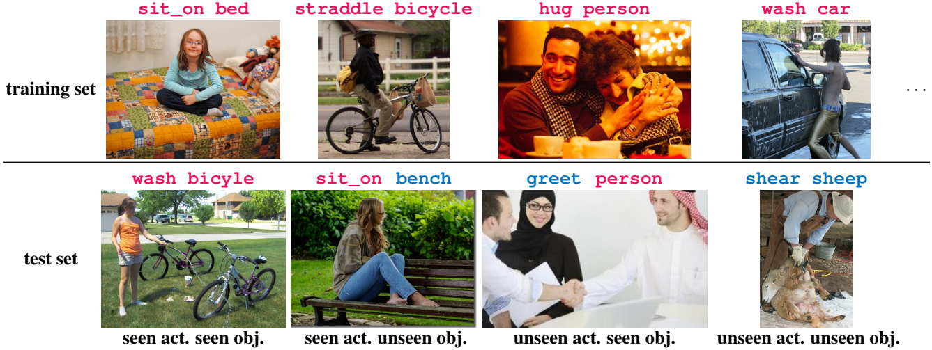
Figure 3. Illustration of our four separate test sets for different types of generalization. We show a few HOI concepts in the training and test sets in the top and bottom row, respectively. We use the red fonts to denote an object or action class that is available in the training set and blue fonts indicate those held-on unseen ones in the test set.

few-shot learning model [6] only has 55.82% accuracy.