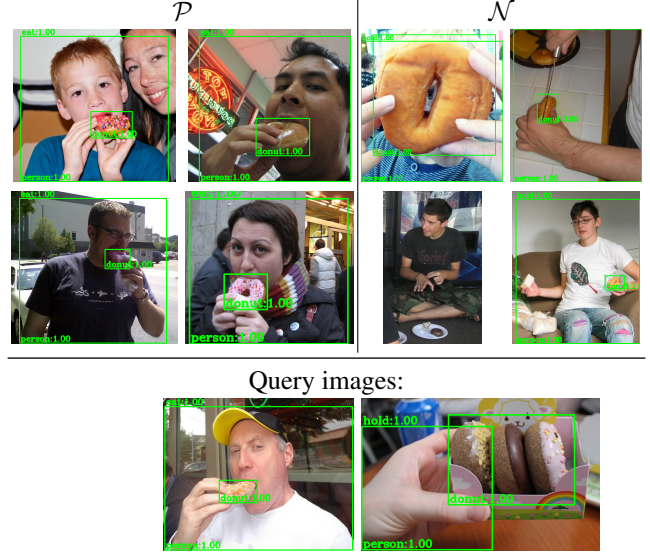
Predictions: positive negative Figure 5. Illustration of our oracle model. We first generate some detections for all the images using HOITrans [52]. Note that some images may not have any detection at all. According to the detections in the \mathcal{P} and \mathcal{N} , the common concept is eat donut . As a result, in the bottom row, the first query image is considered to be positive as its HOI detections contain eat donut . The second query image is negative. Zoom in for the best view.

We benchmark the models introduced in Section 3 on Bongard-HOI to test their performance on human-level few-shot visual reasoning. We use a ResNet50 [11] as an encoder for the input images. We consider different pre-training strategies: 1) no pre-training at all (scratch), 2) pre-trained on the ImageNet dataset with manual labels [8], and 3) latest self-supervised approach [5] pre-trained on ImageNet but without manual labels. We train an Faster R-CNN [37] class-agnostic objectness detection model on the COCO dataset [33] using a ResNet101 [11] pre-trained on ImageNet [8] as the backbone. We use the RoIPool operation [37] to get feature representations for each bounding