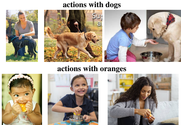
Figure 2. Examples of different actions with the same object. From top to bottom, left to right: washing, walking, and feeding dogs; eating, squeezing, and peeling oranges. To differentiate these images, we need compositional understanding on both the actions and the objects. We exploit this to select hard negatives in Bongard-HOI: negative images contain the same object as the positives, but the actions are different.

nizing object categories instead of the compositional structures of visual concepts, e.g. , visual relationships. A parallel line of research aims at building benchmarks for abstract reasoning by taking inspiration from cognitive science such as RPM (Raven-style Progressive Matrices) [2, 43] and Bongard-LOGO [3, 32]. In these benchmarks, a model has to learn concept induction rules from a few examples and the concepts are context-dependent in each task. However, they use simple synthetic images [2, 32] or focus on basic object-level properties, such as shapes and categories [43].