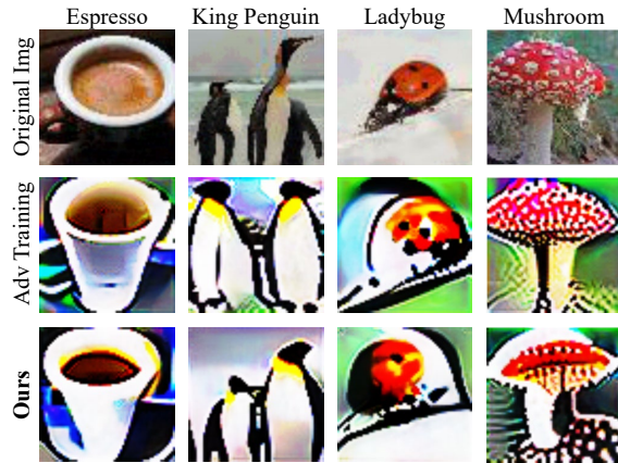
Figure 3. Feature visualization results of Tiny-ImageNet that include semantic information for target objects. We compare MAD with non-pruned model (AT) for VGG-16. We set the pruning ratio of MAD as 90% and illustrate successfully defended cases.

As seen in this figure, we have observed that MAD can retain the semantic information of the intermediate feature representation, even with the high pruning ratio. Compared with the visualization results of the non-pruned model, MAD seemingly loses some feature representation, but still shows the recognizable quality in the semantic information of target objects regardless of the high pruning ratio.