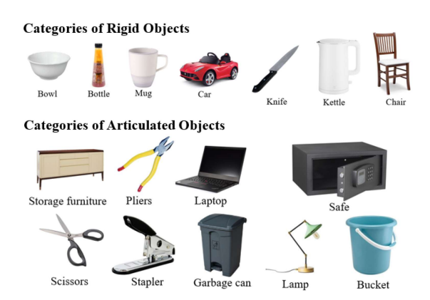
Figure 4. Diversity of object categories.