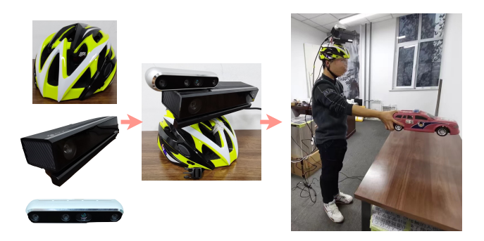
Figure 2. Data capturing system. we build up a simple headmounted data capturing suite consists of a bicycle helmet, a Kinect v2 RGB-D sensor, and an Intel RealSense D455 RGB-D sensor.

To construct HOI4D, we build up a simple head-mounted data capturing suite consisting of a bicycle helmet, a Kinect v2 RGB-D sensor, and an Intel RealSense D455 RGB-D sensor as shown in Figure 2. Two RGB-D sensors are precalibrated and synchronized before the data capturing process. Participants wear helmets to execute various tasks and interact with a diverse set of daily objects in different indoor scenes. We pre-define the pool of tasks that involves not only simple pick-and-place but also other functionalityoriented tasks such as placing a mug inside a drawer. To complete these tasks, participants need to properly plan their actions based on the specific scene configuration. For example, if the drawer is open then the participants just need to place the mug inside the drawer directly. Otherwise, they might need to open the drawer first. Worth mentioning, we adopt two popular RGB-D cameras, Intel RealSense D455 and Kinect v2, which are good complements to each other. Kinect v2 is based upon Time of Flight (TOF) and captures long-range content. The RealSense D455 is a structured light-based camera and has more advantages within a shortrange (about 1m). Together the two sensors could capture the 3D scene more comprehensively and they also provide a natural testbed for cross-sensor transfer learning.