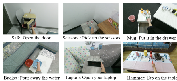
Figure 5. Examples of interaction task

Category overview. Figure 4 shows the object categories contained in our dataset. We select 16 common object categories in our daily life (7 rigid object categories, 9 articulated object categories) to construct our dataset. Each cate-