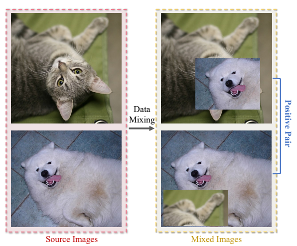
Figure 1. For the mixed images that share the same source ( e.g. , a cat image and a dog image), they are semantically related and can be treated as additional positive pairs in self-supervised learning.

However, interestingly, data mixing plays little role in the recent surge of self-supervised learning. For instance, while naïvely replacing original images with their mixed counterparts substantially improves Vision Transformers (ViTs) in the supervised setting [39], it cannot improve ViTs under the self-supervised setting. Though many efforts [27, 31, 42] have been made recently by developing more sophisticated training strategies in data mixing, they