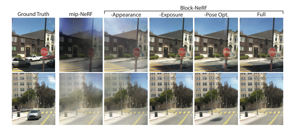
Figure 7. Model ablation results on multi segment data. Appearance embeddings help the network avoid adding cloudy geometry to explain away changes in the environment like weather and lighting. Removing exposure slightly decreases the accuracy. The pose optimization helps sharpen the results and removes ghosting from repeated objects, as observed with the telephone pole in the first row.

can reduce the overall computational cost as not all of the models need to be evaluated (see bottom section of Table 2).