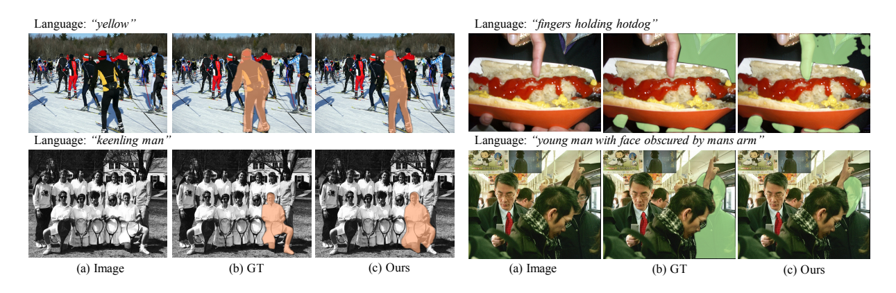
Figure 5. Qualitative examples of failure cases. Best viewed in color.

refine module. Finally, occlusion could cause failure cases, which is a challenging problem in many vision tasks.