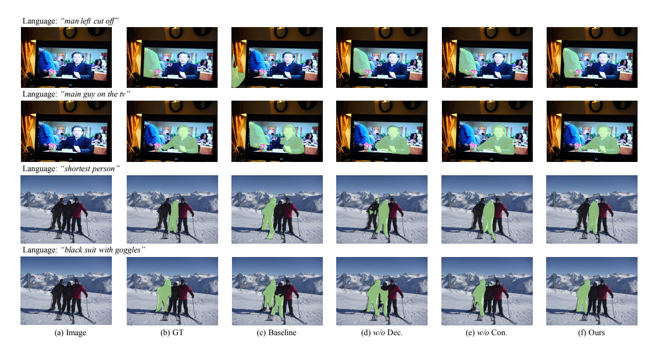
Figure 4. Qualitative examples with different settings. (a) the input image. (b) the ground turth. (c) the baseline network. (d) CRIS without Vision-Language Decoder. (e) CRIS without Contrastive Learning. (f) our proposed CRIS. Best viewed in color.