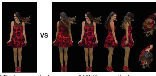
(a) Single-perspective Image (b) Multi-perspective Image Figure 3. Presentation of projected images from "RedandBlack".

"Statue" as references [36]. Then, we choose seven typical distortion types refer to current prevalent databases, including Octree (OT), DownSampling (DS), Geometrical Gaussian Noise (GN), Color Noise (CN), Color Quantization Noise (QN), Local Loss (LL) and V-PCC (VPCC). These distortions cover the basic cases of point cloud capture, compression, and reconstruction. Other complex distortions are the superimposed cases of these basic types. For OT, DS, GN, and CN, we use the function scripts provided by [36] and process the reference samples into four different levels. Similarly, QN, VPCC, and LL are generated via the scripts provided by [19]. In total, we prepare 3 \times 7 \times 4 = 84 distortion samples as test sequences. Based on 3 reference and 84 distorted samples, we use projection method proposed by [36] to generate single- and multi-perspective images. We integrate a visual graphical interface to collect data.