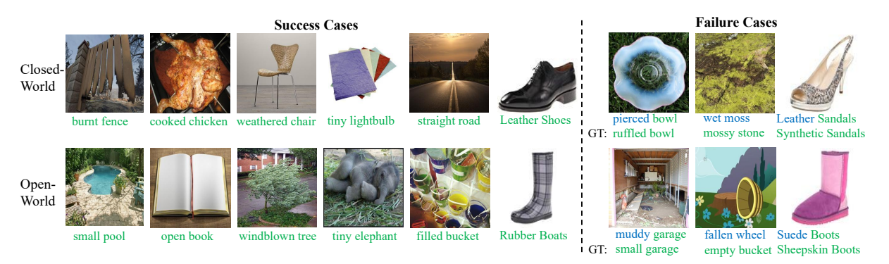
Figure 3. Qualitative results. We evaluate top-1 predictions for some cases on MIT-States and UT-Zappos. The first row shows the results of the closed-world and the bottom row is the open-world. Six cols on the left are examples of successful predictions, and three on the right are examples of failures. For the failure cases, blue denotes the wrong prediction and all images are randomly selected.

with only decomposition section ( DeC ) and with decomposed fusion module ( DFM ). The closed-world and openworld experimental results can be seen in Tab. 3.