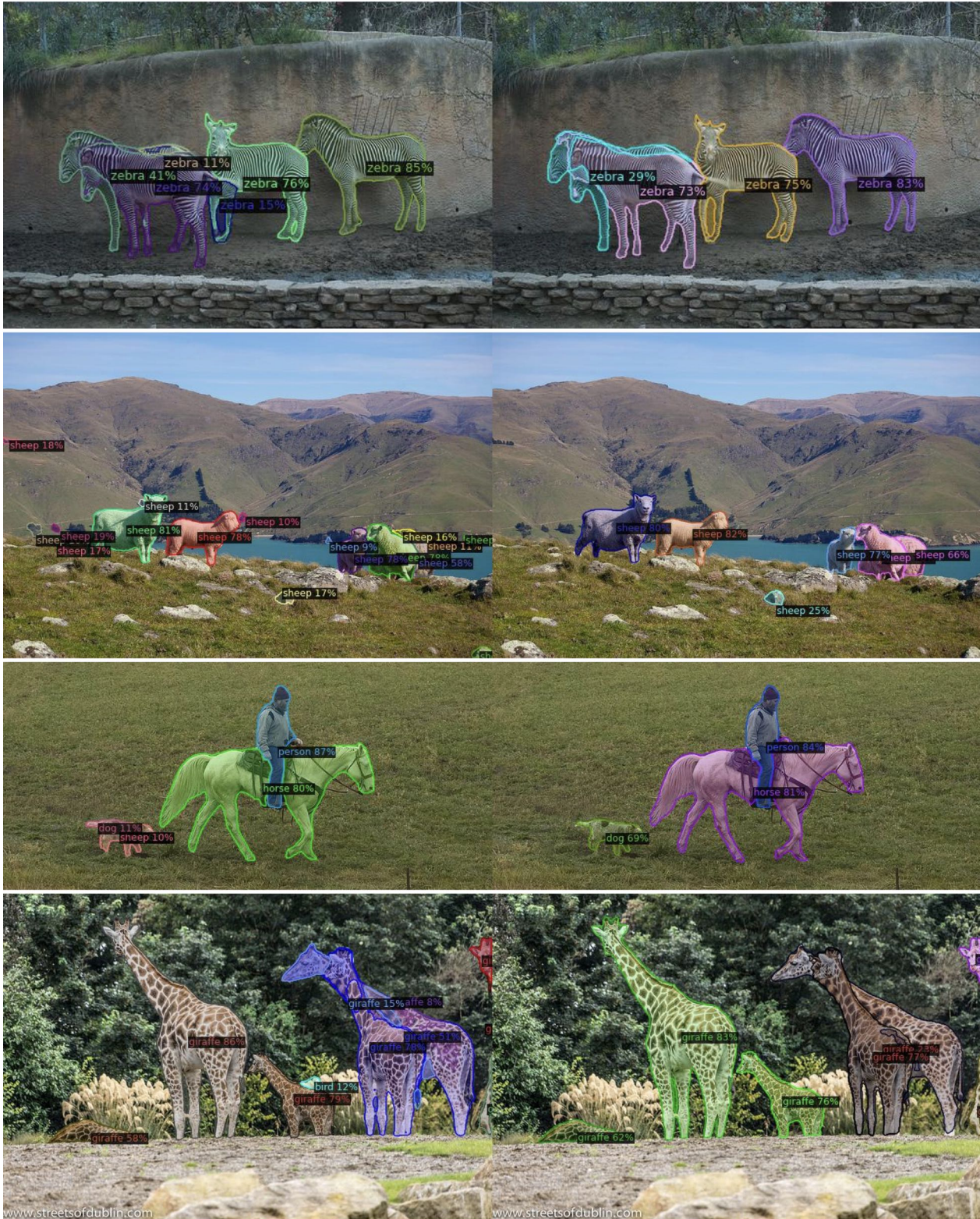
Figure 8. Qualitative comparison on COCO-val-2017 dataset: Images on left are predictions made by SOLOv2, images on right are predictions by our model with Semantic Sorting and Semantic NMS.