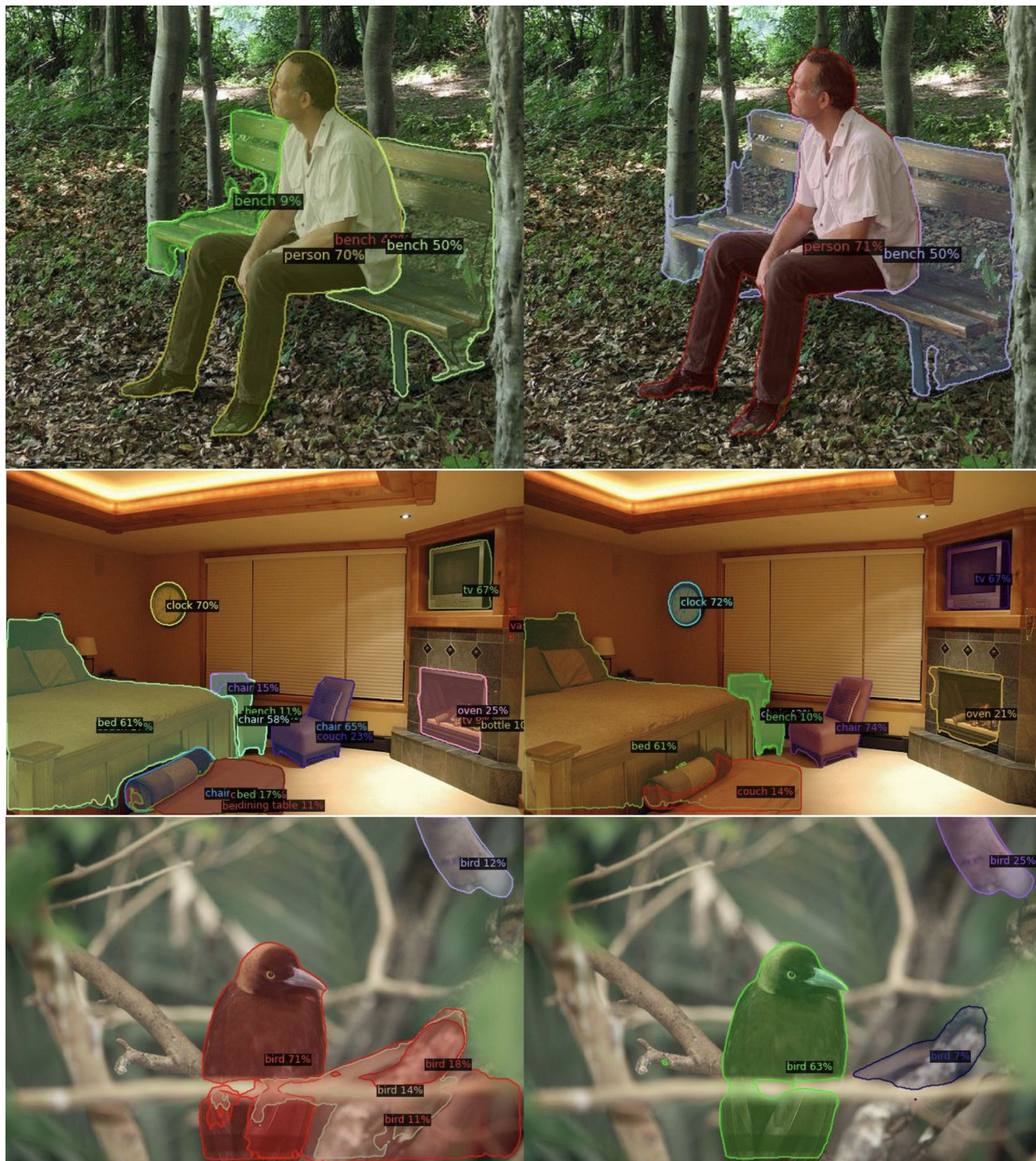
Figure 9. Qualitative comparison on COCO-val-2017 dataset: Images on left are predictions made by SOLOv2, images on right are predictions by our model with Semantic Sorting and Semantic NMS.