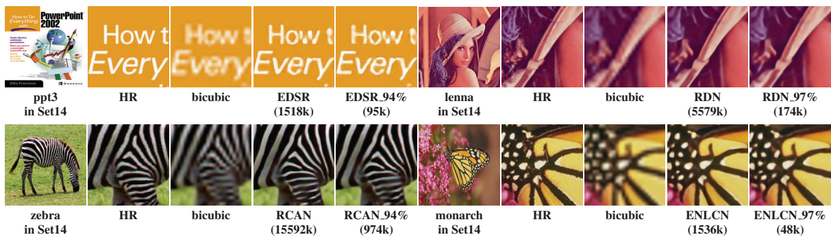
Figure 2. Visual comparisons of other SR models with IMP-SSD on Set14 for 4x SR.