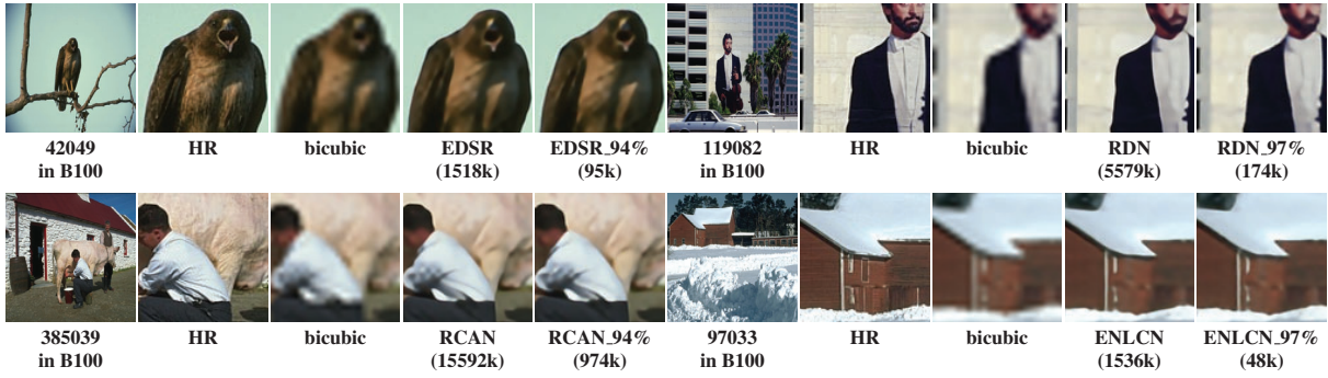
Figure 3. Visual comparisons of other SR models with IMP-SSD on B100 for 4\times SR.