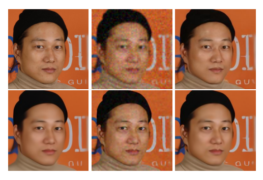
Figure 2. SRx4 with noise level 0.05. Top row, from left to right: original, upsampled observation, and our DDPG. Bottom row, from left to right: PGM-LS, IDBP, and our IDPG (baseline for DDPG).