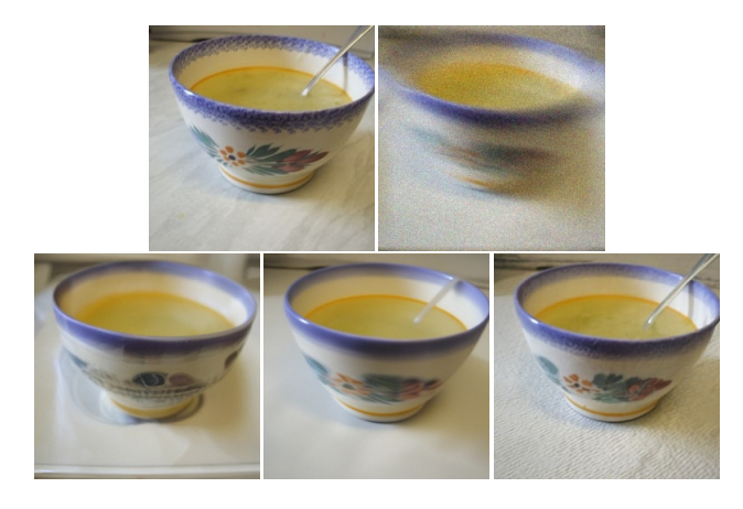
Figure 1. Motion deblurring with noise level 0.05. From top to bottom and left to right: original, observation, DPS [6], DiffPIR [45] and our DDPG.

where \mathbf{A} \in \mathbb{R}^{m \times n} is a measurement operator with m \leq n , and \mathbf{e} \sim \mathcal{N}(\mathbf{0}, \sigma_e^2 \mathbf{I}_m) is an additive white Gaussian noise. For example, in the denoising task \mathbf{A} is the identity matrix \mathbf{I}_n ; in the deblurring task \mathbf{A} is a blur operator; and in the super-resolution task \mathbf{A} is a composition of sub-sampling and (anti-aliasing) filtering. Image restoration problems are ill-posed: just looking for \mathbf{x} \in \mathbb{R}^n that fits \mathbf{y} based on the observation model does not suffice for a successful recovery. Thus, it is required to utilize prior knowledge on the nature of \mathbf{x}^* .