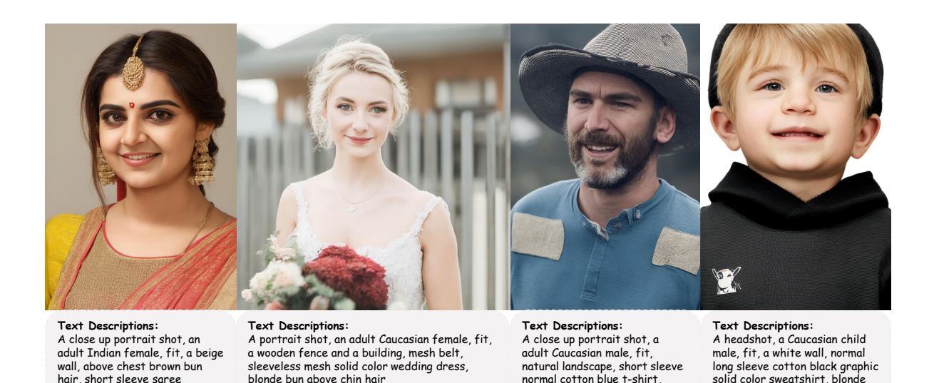
Figure 1. CosmicMan. High-fidelity images generated by our proposed human-specialized text-to-image foundation model CosmicMan. The results are with meticulous appearance, reasonable structure, and precise text-image alignment with detailed dense descriptions.

{lishikai, fujianglin, wangwentao}@pjlab.org.cn 1154864382@mail.dlut.edu.cn linjunyi9335@gmail.com wuwenyan0503@gmail.com