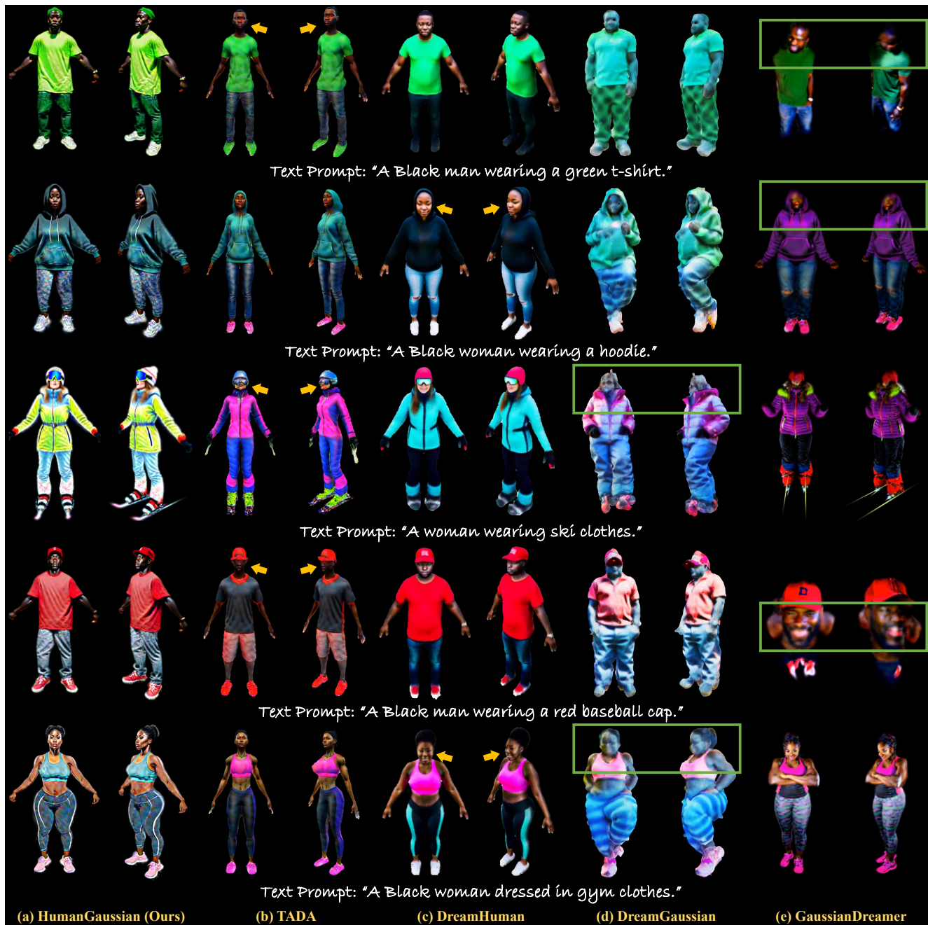
Figure 3. Visual Comparisons with Text-to-3D and 3D Human Models. We compare with recent state-of-the-art baselines on five different prompts, each showing two camera views. Note that the textural unrealism and blurriness are highlighted with yellow arrows; the geometric artifacts are highlighted with green rectangles. Please kindly zoom in for best view and refer to demo video for more results.

or training code of DreamHuman is not officially released, we directly use the results from their paper and project page.