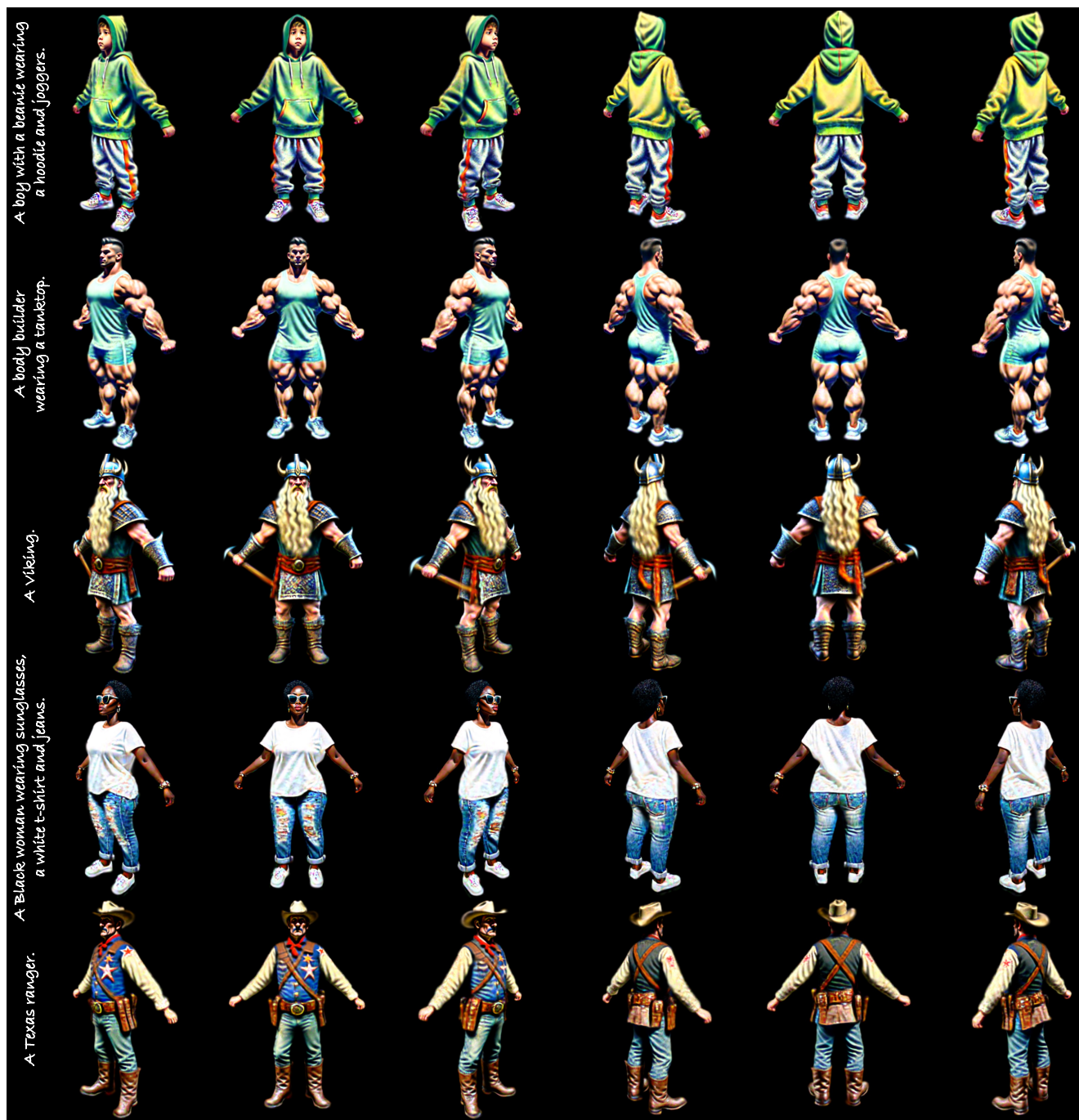
Figure 1. We propose HumanGaussian , an efficient yet effective framework that generates high-quality 3D humans with fine-grained geometry and realistic appearance. Our method adapts 3D Gaussian Splatting into text-driven 3D human generation with novel designs.

Project Page: https://alvinliu0.github.io/projects/HumanGaussian