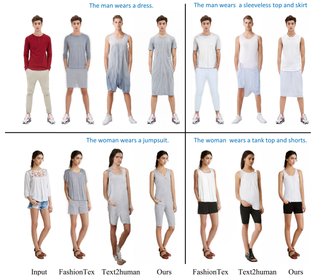
Figure 4. Comparison of our model on clothing style editing. We use a garment image reference for better visualization.

While CLIP features excel at generating stationary textures like solid colors, they struggle with non-stationary patterns like plaids, inaccurately capturing their scales and color distributions. To address this, we add a positional encoding layer \mathcal{P}_e before feeding the CLIP features C_t obtained above into the U-Net. The added positional information allows for capturing intricate visual details like plaid scales and color variations, markedly improving output quality. Thus, this enhancement substantially improves the model’s ability to represent non-stationary garment textures.