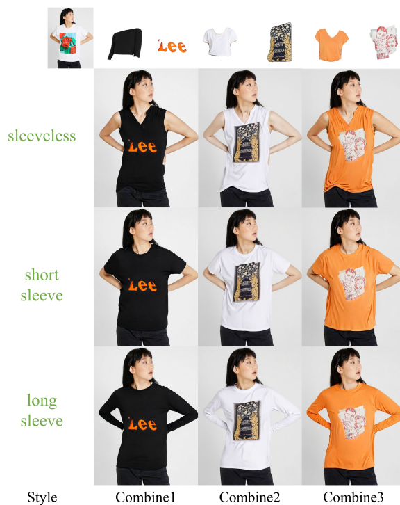
Figure 9. Fashion design results under different conditions including style, texture, and design elements (e.g., logo).

In conclusion, we have introduced the novel task of virtual try-on from unconstrained fashion designs (ucVTON) to enable flexible and photorealistic synthesis of personalized composite clothing. Our key technical contributions include a two-stage disentanglement pipeline to explicitly separate style and texture when using full garment images