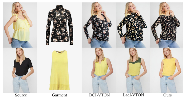
Figure 8. The comparison of virtual try-on based on in-shop cloth.