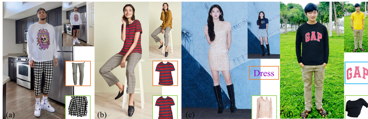
Figure 1. Examples of virtual try-on manipulations using ucVTON on in-the-wild real images. Orange box: style control; Green box: texture control; Blue box: design elements control.

Shuliang Ning 1,2,3 Duomin Wang 3 Yipeng Qin 4 Zirong Jin 2 Baoyuan Wang 3 Xiaoguang Han 2,1,* 1 FNii, CUHKSZ 2 SSE, CUHKSZ 3 Xiaobing.AI 4 Cardiff University