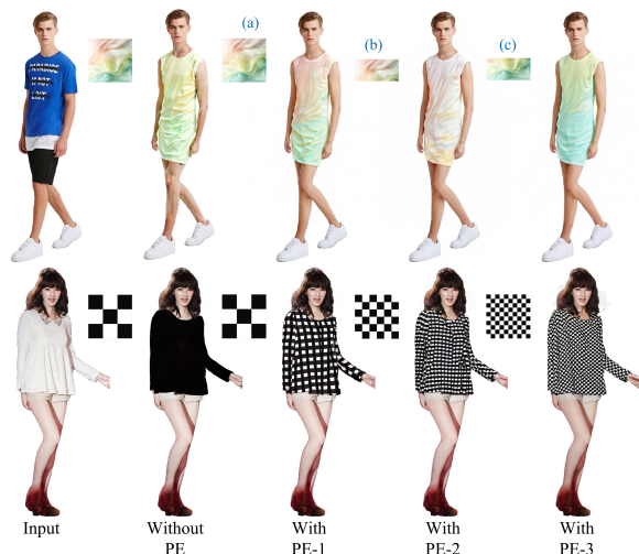
Figure 7. The effectiveness of position encoding, where (b) and (c) are the upper part and lower part of (a) respectively.