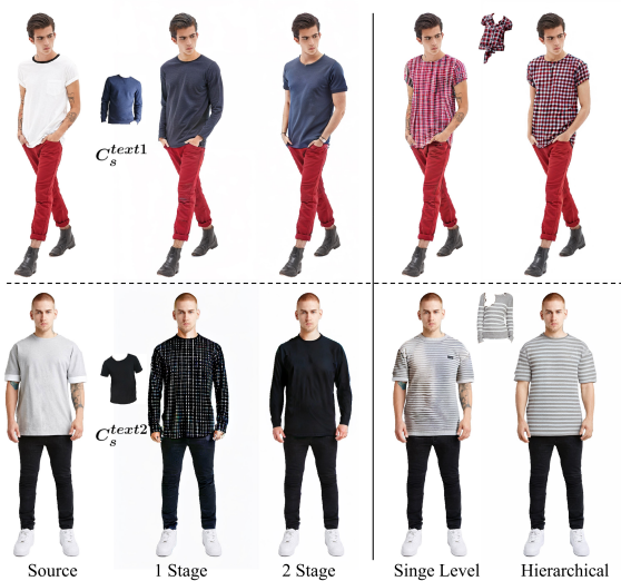
Figure 6. The ablation studies of our two-stage disentanglement and hierarchical CLIP features. C_s^{text1} : “He wears a short-sleeve T-shirt with floral patterns.” C_s^{text2} : “His shirt has long sleeves, cotton fabric and plaid patterns.”