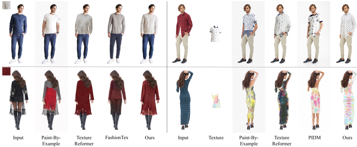
Figure 5. Visual Comparison on garment texture transfer.