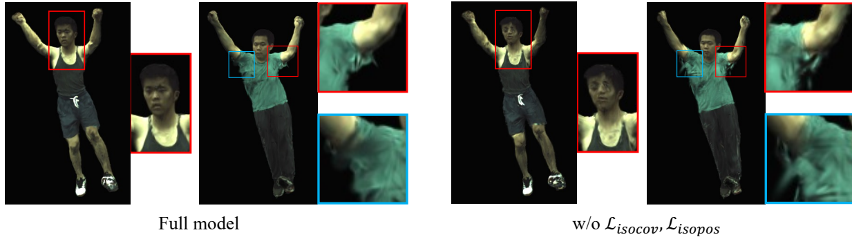
Figure 4. Ablation Study on as-isometric-as-possible regularization, which removes the artifacts on highly articulated poses.