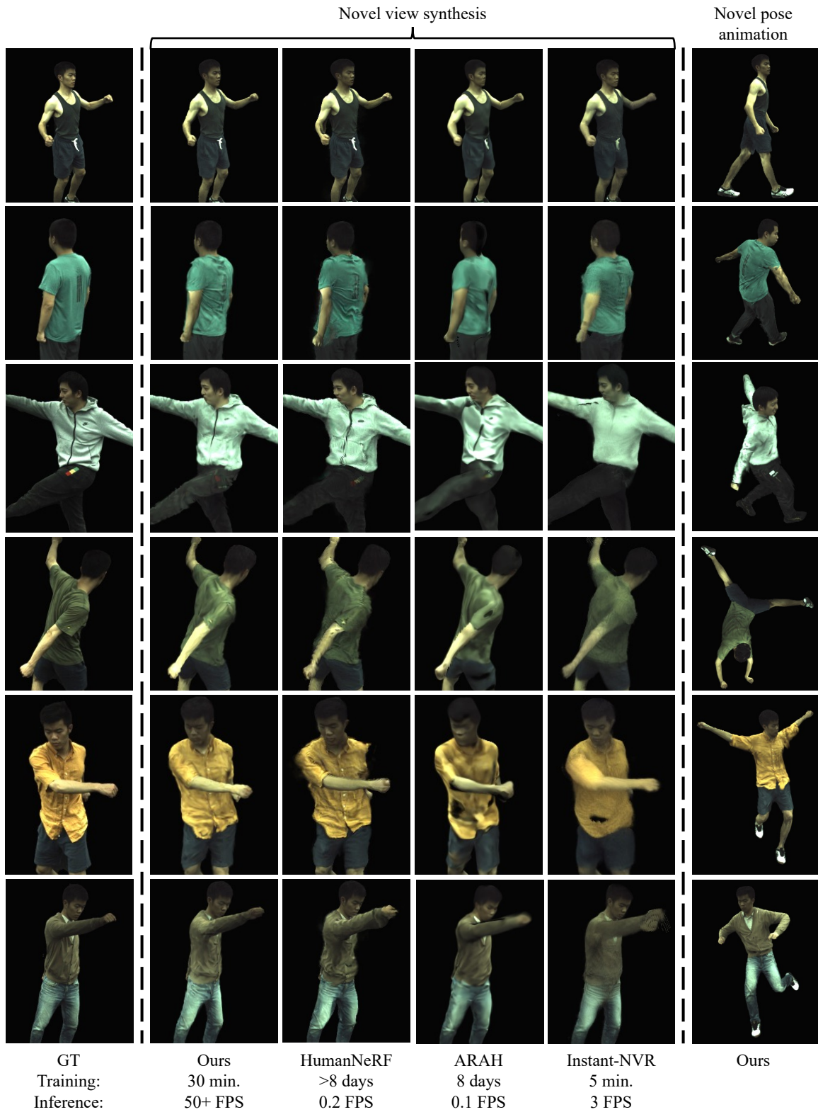
Figure 3. Qualitative Comparison on ZJU-MoCap [37]. We show the results for both novel view synthesis and novel pose animation of all sequences on ZJU-MoCap. Our method produces high-quality results that preserve cloth details even on out-of-distribution poses.