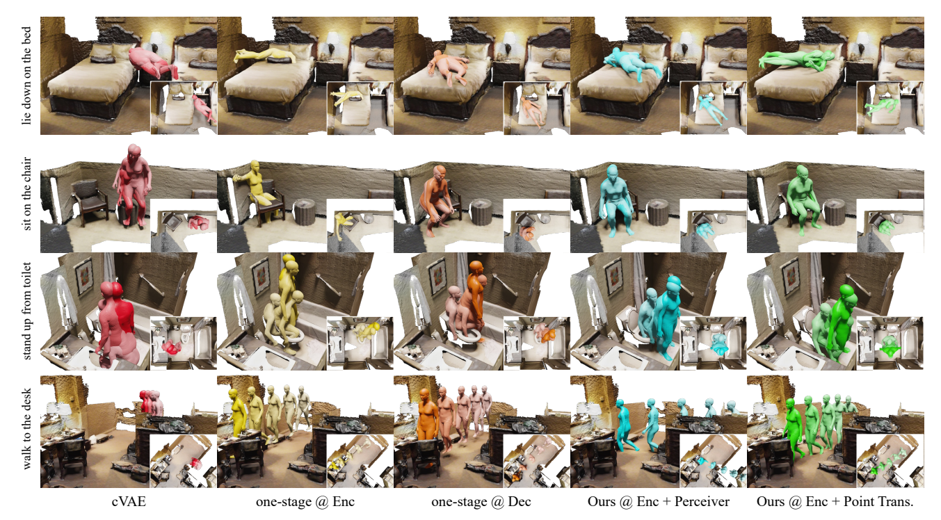
Figure 3. Qualitative results on HUMANISE dataset. The bottom-right figure provides a top-down view. Zoom in for better visualization.

across goal dist., contact, quality , and action scores, signaling a pronounced advancement in generating human motion that aligns accurately with scene and language instructions. Note that the diminished diversity in the APD metric mainly stems from the enhanced precision in motion generation within our model, which effectively grounds motions in the 3D scene with desired semantics and interactions, as opposed to the motions with potential physical implausibility, incorrect semantics or inadequate grounding observed in the baselines methods.