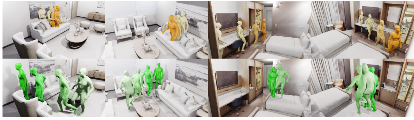
"A person wanders in the room around the table."