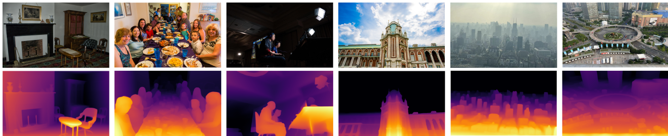
Figure 1. Our model exhibits impressive generalization ability across extensive unseen scenes. Left two columns: COCO [35]. Middle two: SA-1B [26] (a hold-out unseen set). Right two: photos captured by ourselves. Our model works robustly in low-light environments (1st and 3rd column), complex scenes (2nd and 5th column), foggy weather (5th column), and ultra-remote distance (5th and 6th column), etc.