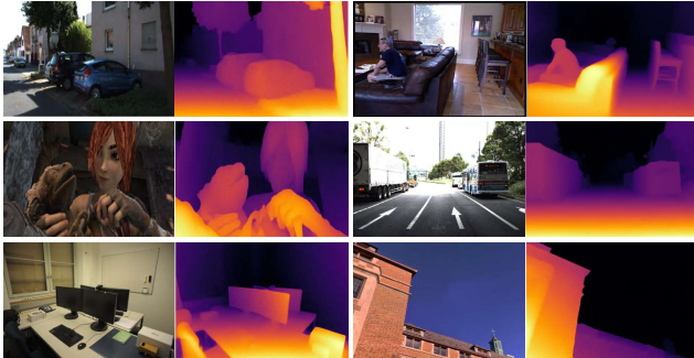
Figure 3. Qualitative results on six unseen datasets.