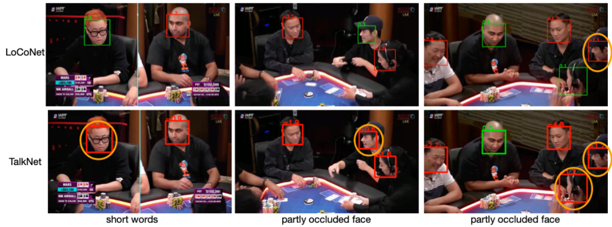
Figure 3. Results of LoCoNet and TalkNet [3] on a video from the Internet. This video shows a livestream of poker game with real-time narration. The results show that predicting speaking activities of a speaker with partly occluded face remains a difficult task.