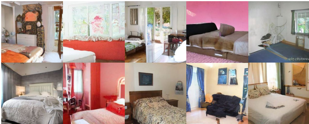
(c) Stego model for hiding four images