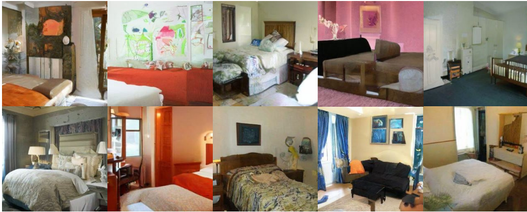
(b) Stego model for hiding two images