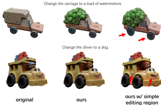
Figure 8. Examples illustrating the importance of our editing-region computation algorithm. We compare our full method with a variant that simply treats all voxels except the preserved parts as the editing region. The latter variant leads to undesired changes near the preserved content (red arrows).