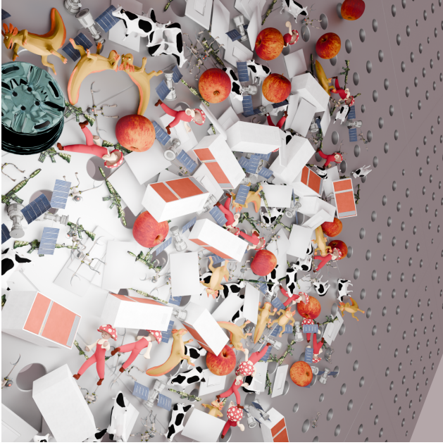
Figure 8. An example of a scene where objects have been dropped onto a surface into a dense pile.

properties. This helps the model be more robust to differences between the CAD prompts and the images of the object in the real world.