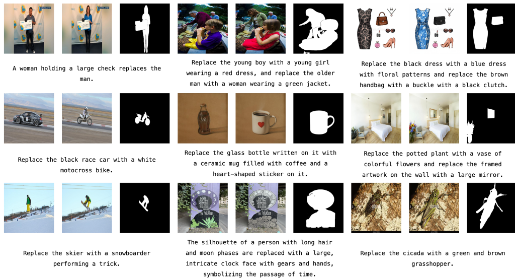
Figure 8. Cases of Single Turn High