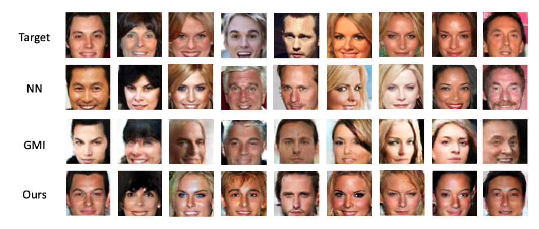
Figure 3. Qualitative comparison for attacking a face recognition model trained on CelebA. The first row shows ground truth images for target identities. The second row shows nearest neighbors of the target images from public domain. And the third and last rows demonstrate the reconstructions produced by the GMI attack and our attack, respectively.