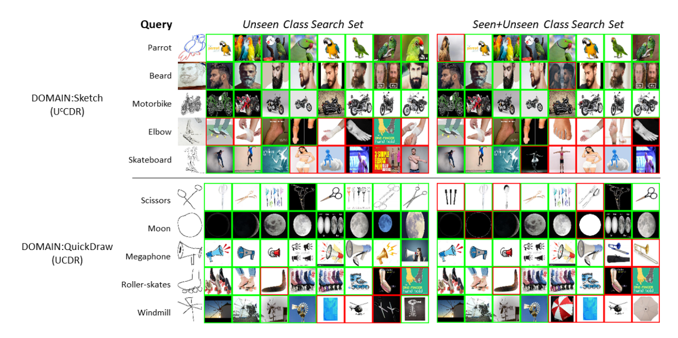
Figure 2: Top-8 retrieved Images for UCDR and U<sup>c</sup>CDR protocols on DomainNet with QuickDraw being the unseen query domain. Same query is considered for both the search set configurations. Green and Red borders indicate correct and incorrect retrievals respectively. (best viewed in color)