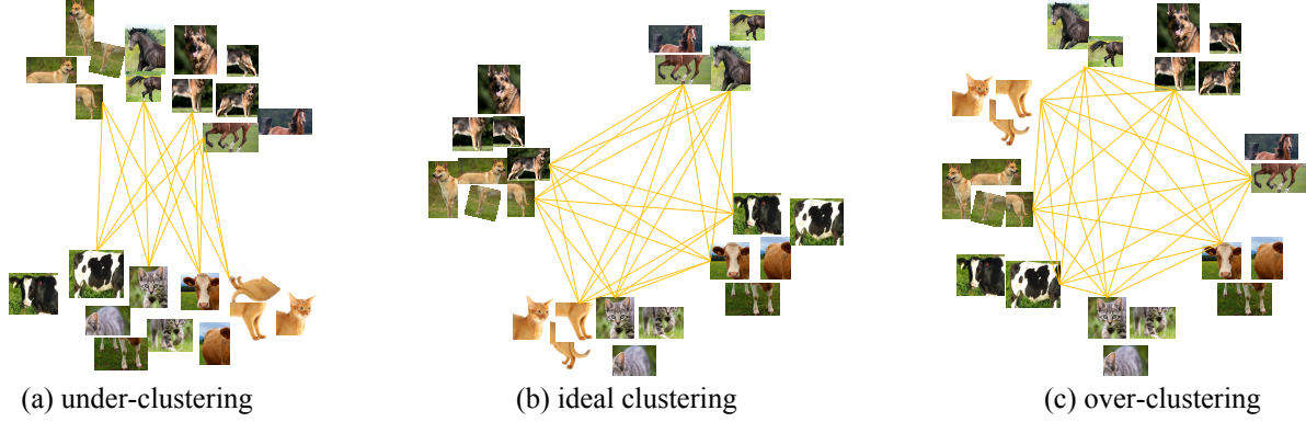
Figure 2. Illustration of under-clustering and over-clustering. Each sample pair connected by a yellow line represents a negative pair.

positive samples [22, 6]. Moreover, Exemplar-CNN [15, 14] directly clarifies each image in a dataset into a cluster, i.e., it categorizes CIFAR-10 into 50K clusters. However, it obtains an unsatisfactory performance. We identify this as an over-clustering problem. Specifically, since each image can be regarded as a cluster, excessive negative sample pairs can over-cluster samples from the same category into different clusters. This over-clustering can lead to bad representation learning since the network just memorizes the data instead of learning from the data [54, 3].