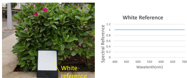
Figure 1. Left: A captured scene of our dataset. Right: The spectral reflectance function of the white reference board.

Our dataset contains hundreds of reflectance images. We capture various scenes containing a whiteboard with flat spectral reflectance as shown in Fig. 1, and calculate the reflectance spectra. The whiteboard also helps us get the ground truth illumination spectra in real experiments. We ensure a single, uniform illumination during capturing so that the calculated reflectance is reliable.