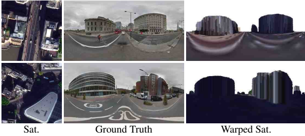
Figure 6: Warped color satellite information. The examples illustrate the low-quality of warped satellite images which often do not provide useful color information.