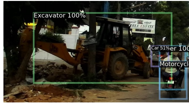
(b) With FusionNet - No incorrect Autorickshaw detection