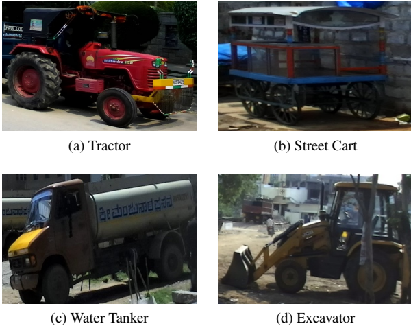
Figure 2: Examples of novel classes in IDD-OS