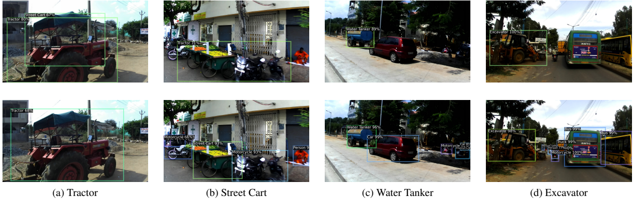
Figure 3: Examples of novel (green bounding boxes) and base (blue bounding boxes) class detections on IDD-OS via Faster R-CNN Finetuning (top row) and DualFusion (bottom row). Base class forgetting and erroneous novel class detections are clearly seen in Finetuning, but both are avoided by DualFusion.

alFusion is able to retain base classes as well as provide better detections for the novel classes. While FewX does outperform DualFusion in two novel classes, it is unable to detect any base classes due to the absence of base class supports in the incremental setting, showcasing DualFusion’s superiority.