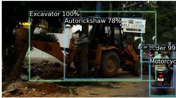
(a) Without FusionNet - Autorickshaw is incorrectly detected