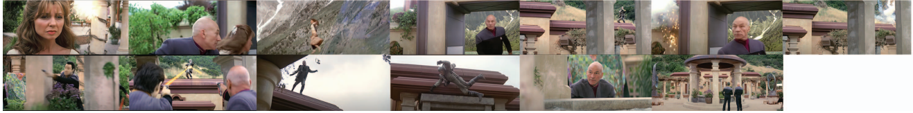
Figure 6. Segment from StarTrek. For a better visualization https://www.youtube.com/watch?v=-1gCG8m1SHU , from the 0:30 to 1:00