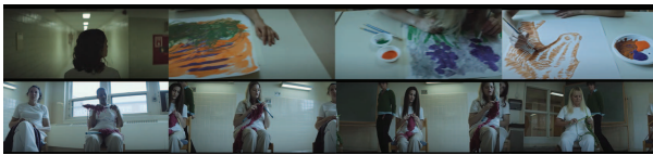
Figure 8. Segment from Thoroughbreds https://www.youtube.com/watch?v=1bBOUr7rAHw , from the 0:30 to 1:00

humans, usually representing dialogues. In this scene, we have a much slower pace with respect to segment 1 and the focus is more on the characters rather than the global context. If we take two segments from different classes that come from the same basic editing pattern cluster we notice fewer differences. The segments shown in 1 are extracted from class 43, which is entirely created from basic editing set 8. The complete segments are reported in Figure 8 and in Figure 9. The scene segment represented in both cases contains mainly medium shots of people interacting with objects. The fact that the two segments end in the same way is partly coincidental. By this, we mean the segments represented by a class can have varying structures as long as they stay within the limits indirectly defined by the editing pace and trend labels.