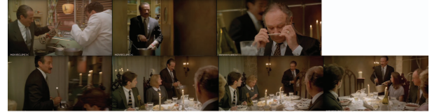
Figure 9. Segment from the birdcage. For a better visualization https://www.youtube.com/watch?v=1pJywLQLzCA , from 1:00 to 1:30

In some cases, the sequences identified by the same label, while they look alike from a segment representation visually, are different. We can show the reason behind this issue with a unique segment 10. This segment is represented with all medium shots. However, the shot sizes vary. This is because the medium shots shown are at the extremities of the medium shot class. Hence one looks more like a close-up while the other one looks more like a long shot. To overcome these issues, a more fine-grained shot size classification system could be implemented while also including more features from the AVE dataset, such as number of people and camera movement . These countermeasures would also enrich the data representation allowing us to charac-