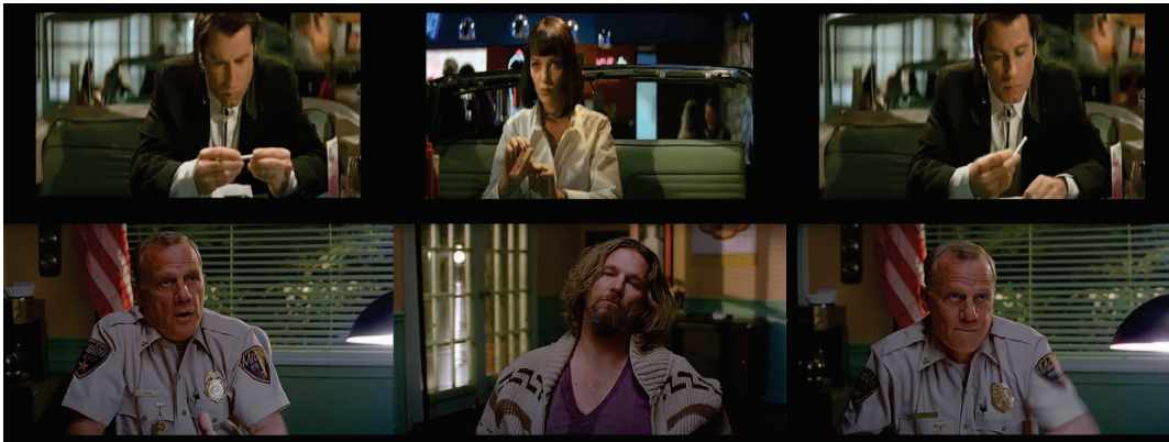
Figure 2. Shot reverse shot extracted from "Pulp Fiction"(top) and "The Big Lebowski"(bottom).