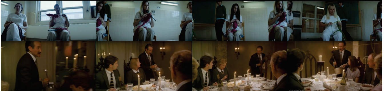
Figure 1. Camera movement showing people interacting with objects from "Thoroughbreds" (top), and "The Birdcage"(bottom).