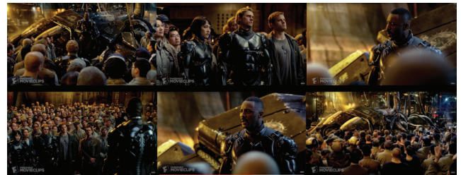
Figure 10. Segment from Pacific Rim. For a better visualization https://www.youtube.com/watch?v=-7Sow81yi24 , from 1:30 to 2:00

terize more complex editing patterns. Another issue is that even if LEMMS can identify more defined labels, there are not enough data examples for the LSTM classifier to learn and thus properly validate them. Thus, if we want to identify more labels and their corresponding segments, we need to increase the amount of data to be analyzed.