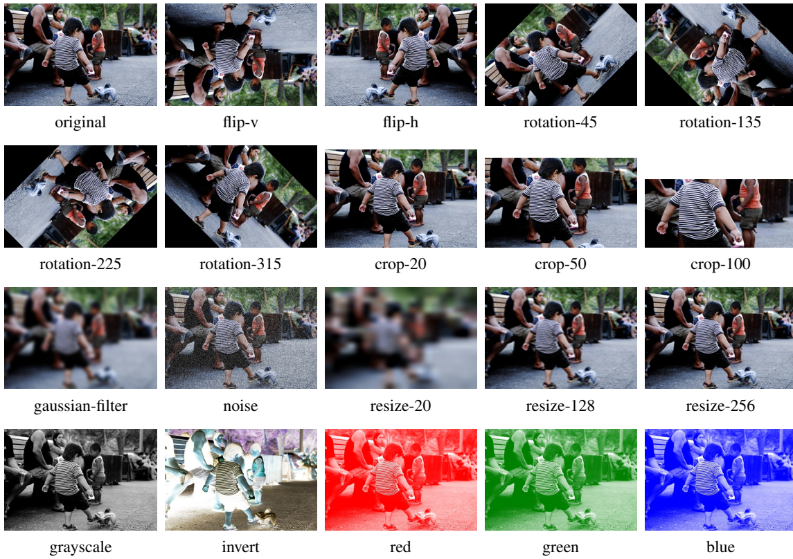
Figure 6. Transformations used in Section 6 for method evaluation.